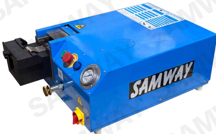
37 degree Flaring Tool